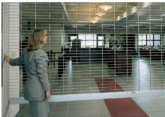
DuraGrille Straight Pattern