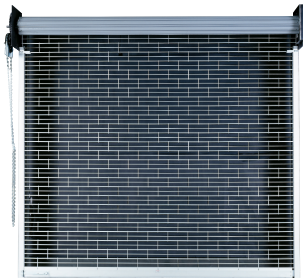
DuraGrille Brick Pattern