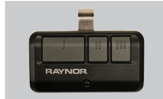
3 Button Transmitter