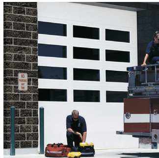
TC Series™, TC300

Raynor also offers a full line of sectional, rolling, fire, high performance and traffic doors, as well as, security grilles. See your Raynor Dealer or visit www.raynor.com for more information.